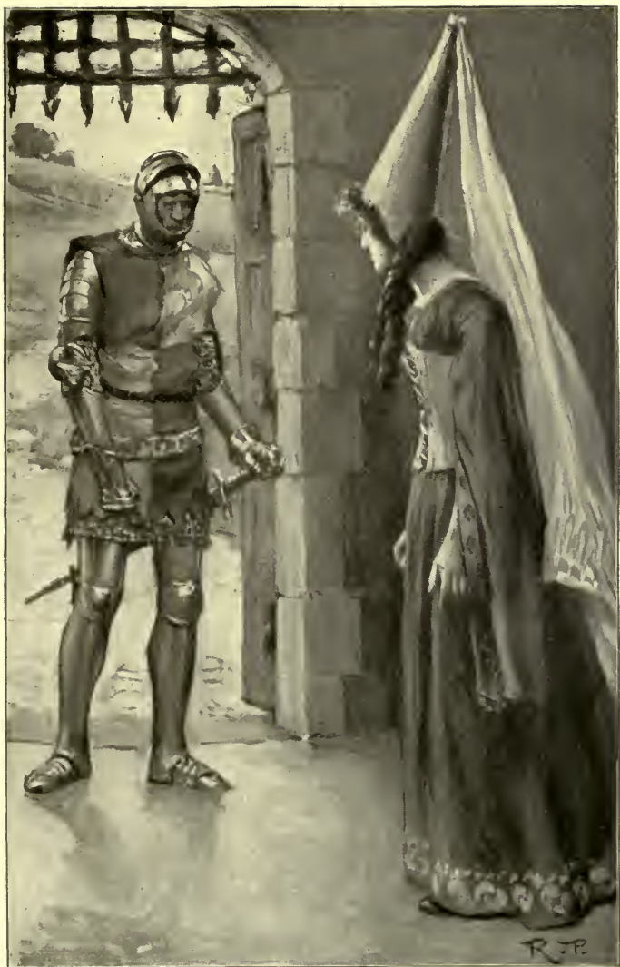
SIR THOMAS TRESHAM BRINGS HIS WIFE NEWS OF THE LOST BATTLE.